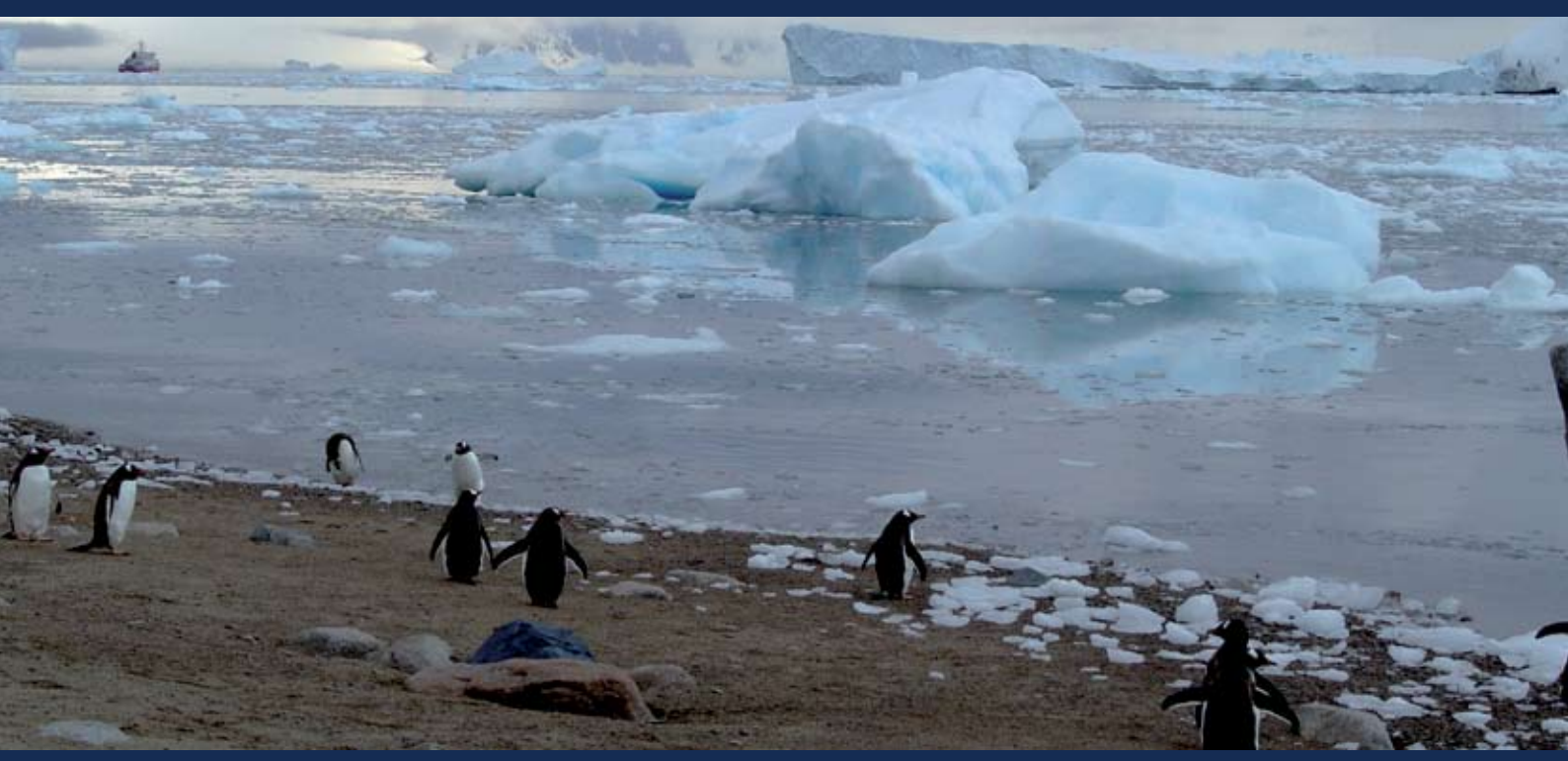
Neko Harbour landing beach